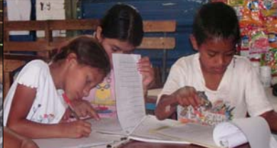
And this is how we became Consultants.

Then we planned the research we were going to do with the other children from our community. We decided what questions we were going to ask in the interviews with the other kids.