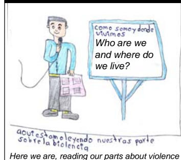
Here we are, reading our parts about violence

We did our presentation; each one took the microphone to read their part.