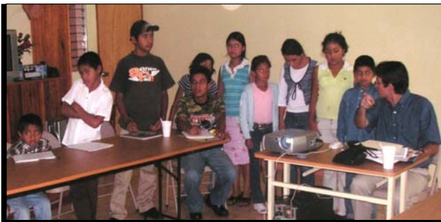
In the last workshop we went to the CESESMA office in San Ramón to put together our final report.