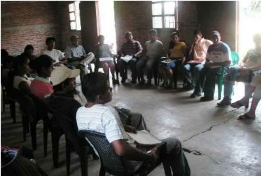
Figure 3: Monthly meeting of the Yasica Sur Area Team in the Community House at La Corona. Team members are aged from 11 to 21.

Stage 5: The most capable and committed promotores/as, typically aged 15+, join CESESMA's area teams. These are the main co-ordinating bodies, responsible for planning, organising, monitoring, follow-up and evaluation of all the young Promotores/as' work in the district (Figure 3).