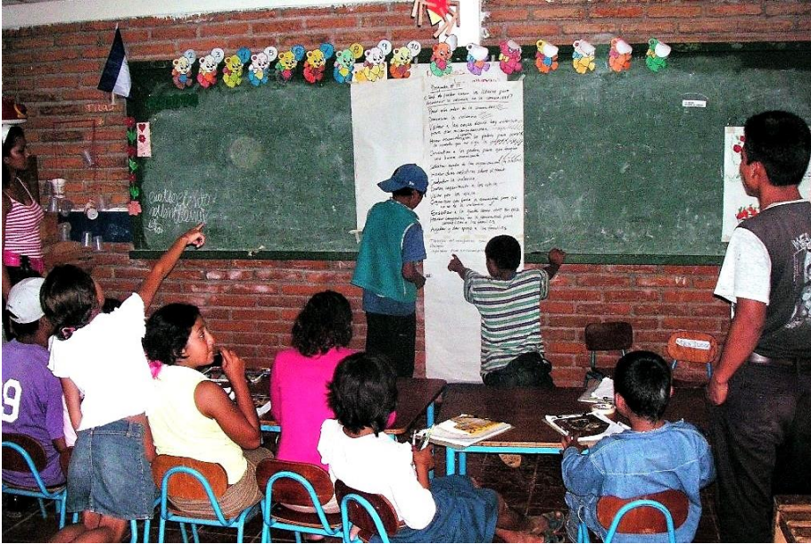
Figure 4: Young Consultants team (age 10-16) drawing up the conclusions from their study in the schoolroom on the coffee plantation.

The children made their final presentation in a large, formal, adult-dominated “invited space”, but because of the preparation they had done in their own space in the months before, and the way this had been facilitated, they felt empowered and confident to speak out, even to the point of presenting a direct challenge to the government Minister for the Family (Figure 5). Any suggestion of tokenism was ruled out, as it was plain to all present that the children took the stage as invited experts on a topic they knew personally and had investigated thoroughly, namely the violence experienced by children and young people like themselves, living and working on the coffee plantations.