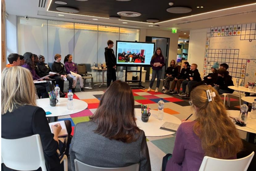
COVISION Ireland Pitch Day presentations