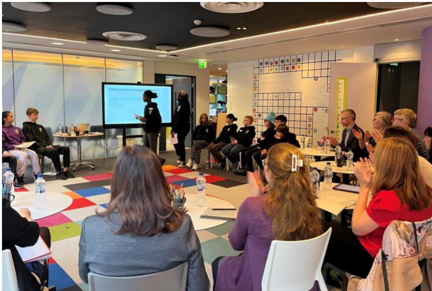
COVISION Ireland Pitch Day presentations

I gave my CARN keynote in Dublin on Sunday 30 October 2022, and just two days later, on 01 November, the Ireland Co-Design team gathered at the Office of the Children's Ombudsman to pitch their ideas to top decision-makers and policy experts.