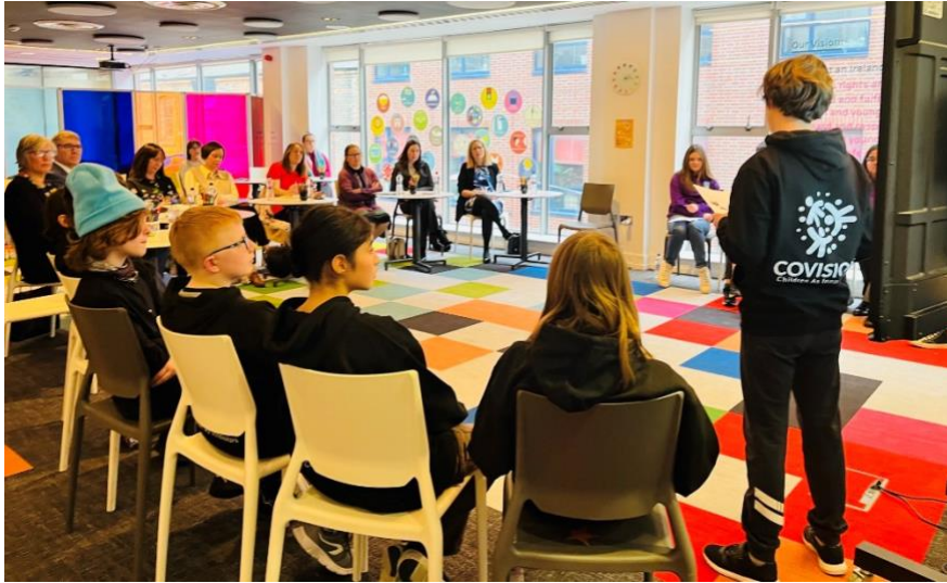
COVISION Ireland Pitch Day presentations

Facing this audience, the children and young people made an impressive and detailed presentation. First they introduced themselves and outlined their methodological process, in order to emphasise for their audience that the proposals they were about to put forward had not been conjured out of the air in an idle moment. Then they gave detailed proposals for policy initiatives in each of their three priority areas. The full proposals will be published elsewhere, and are too detailed to present here, so I will just give a few headline ideas for each topic: