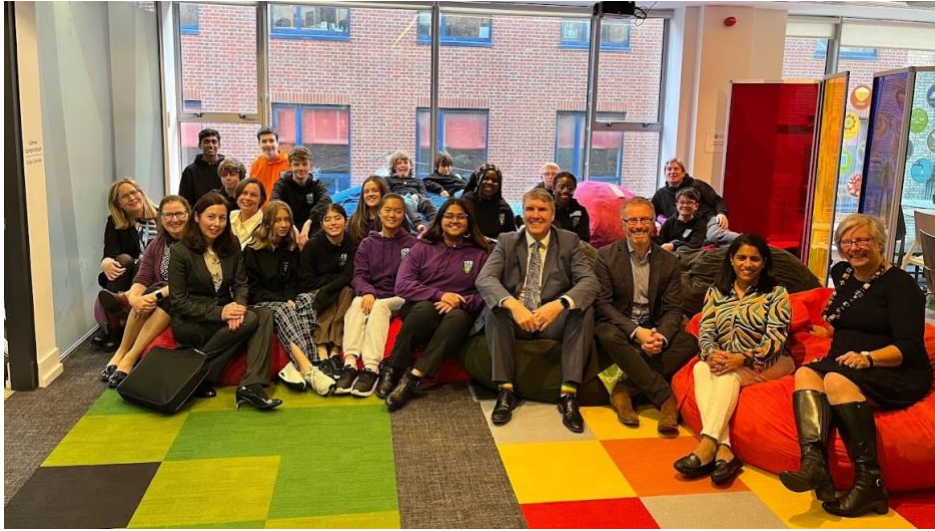
COVISION Ireland Pitch Day