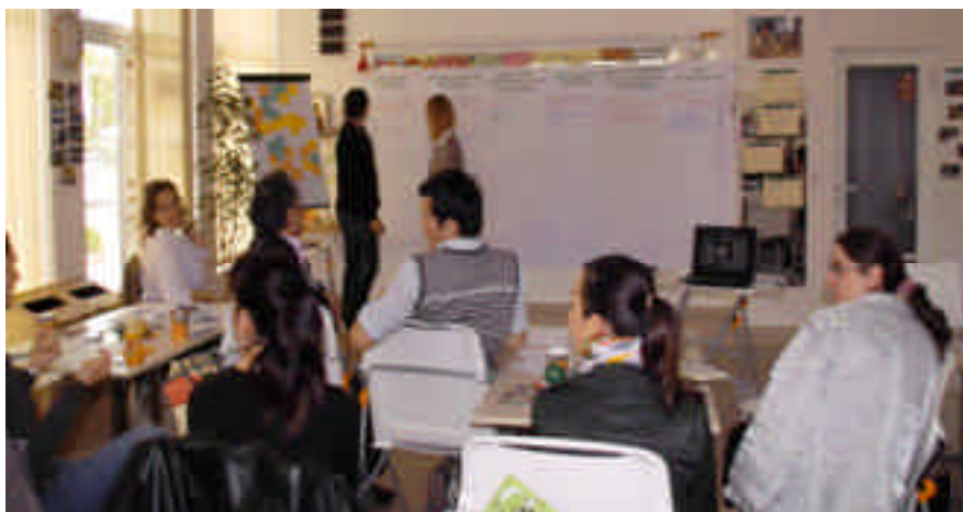
Consultations in progress