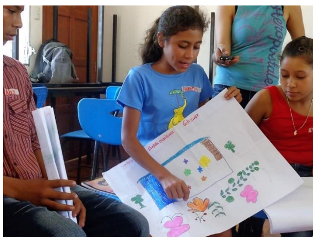
Young researcher from Santa Martha shares her drawing of a scene from her school