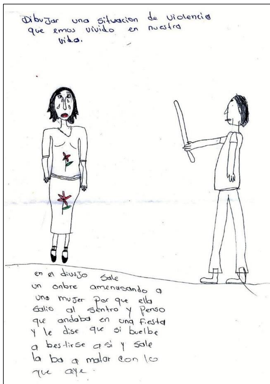
Drawing by a girl aged 11 from a rural community in Matagalpa.