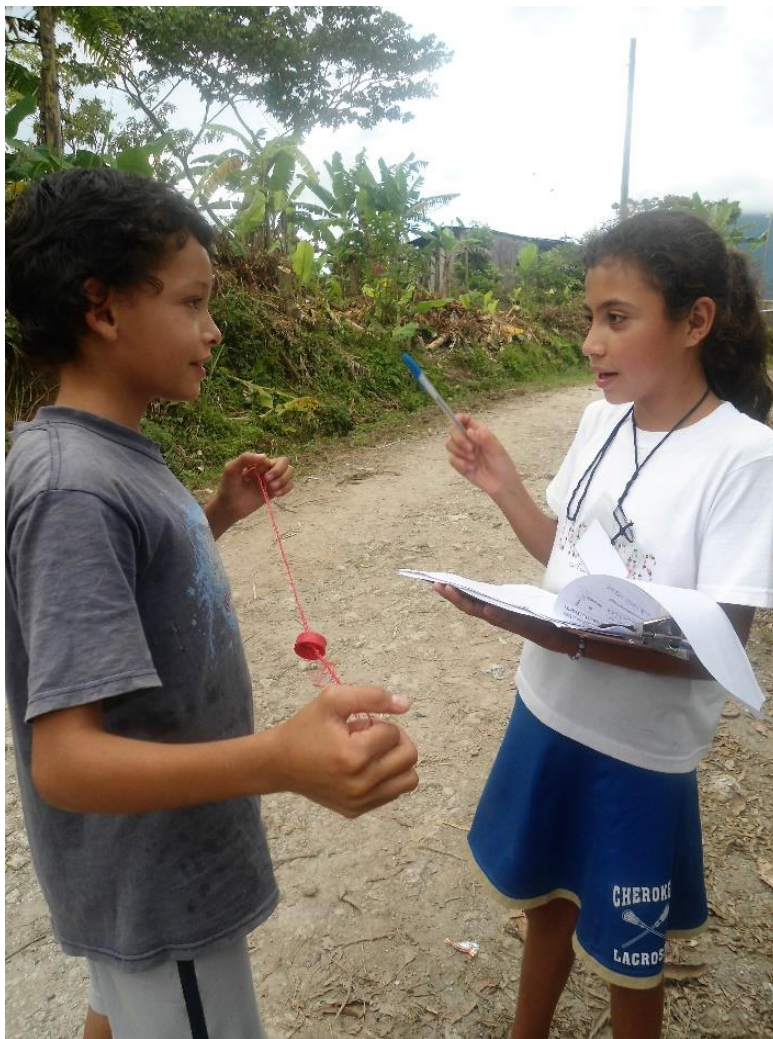
Young researcher interviewing a classmate in San Francisco, La Dalia