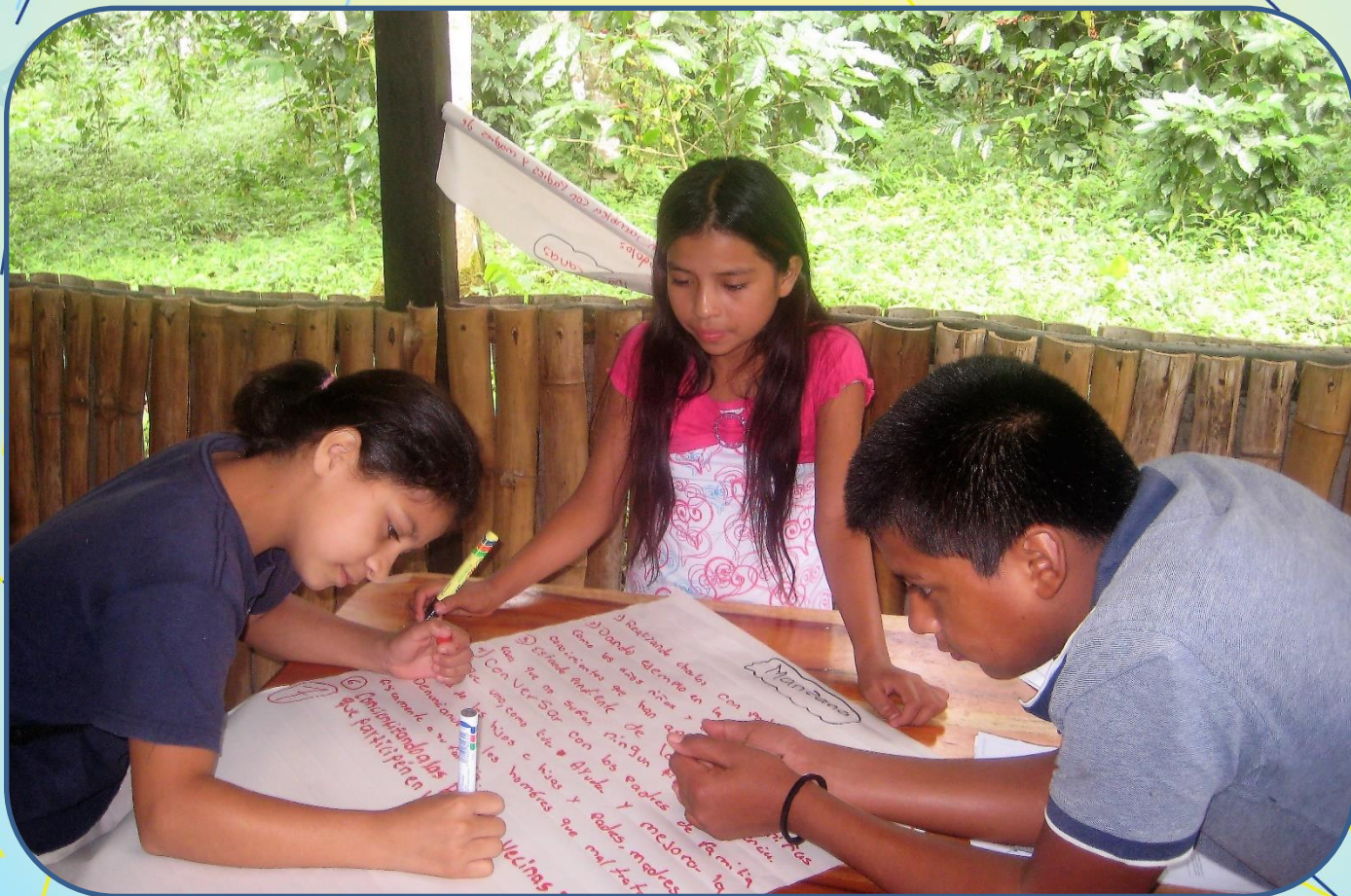
Children from Santa Martha Coffee Plantation

A step-by-step methodological guide from CESESMA in Nicaragua