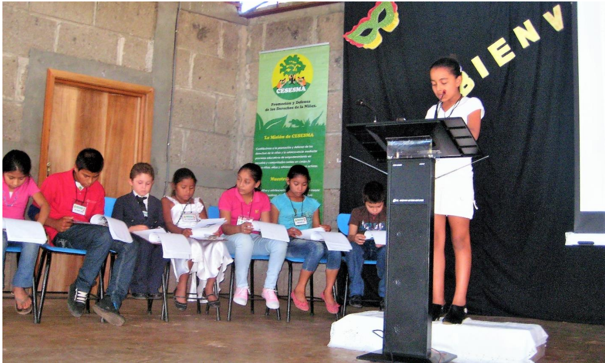
Young researchers from El Tuma-La Dalia present their research findings to an international audience of adult experts